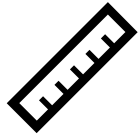
TABLE SPACING + SEATING