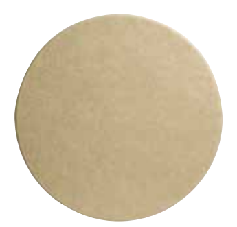
Round: 20", 26", 30", 32", 36", 42", 48", 52", 60" Square: 26", 30", 36", 42", 48" Rectangular: 24" x 30", 24" x 36", 30" x 44"