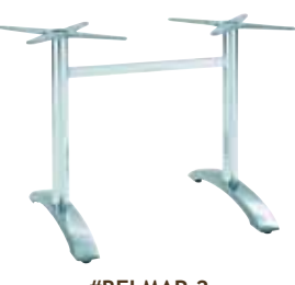
#BELMAR 2 #BELMAR 2 TEAK 24<sup>3</sup>/<sub>4</sub>"w x 28"l x 28<sup>1</sup>/<sub>8</sub>"h