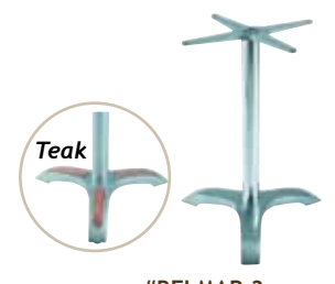
#BELMAR 3 #BELMAR 3 TEAK 22<sup>7</sup>/<sub>8</sub>"w x 28<sup>1</sup>/<sub>8</sub>"h