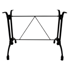
#MARGATE 2 25<sup>3</sup>/<sub>8</sub>"w x 33<sup>7</sup>/<sub>8</sub>"d x 28"h