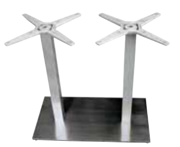
#FUTURA 16"w x 32"d x 27<sup>1</sup>/<sub>2</sub>"h