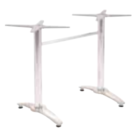
#BRADLEY 2 22^{3}/_{8} "w x 29^{1}/_{2} "d x 28"h