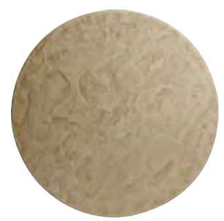
Round: 18", 20", 24", 30", 36", 42", 48", 54" Square: 24", 32", 36", 42" Rectangular: 24" x 36", 30" x 44" Oval: 42" x 72", 42" x 84"