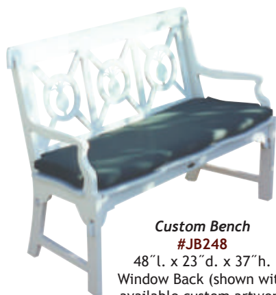
Custom Bench #JB248 48"l. x 23"d. x 37"h. Window Back (shown with available custom artwork and cushion)