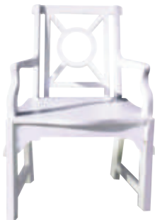
Garden Armchair #JGC201 22 1 / 2 " w. x 22" d. x 35" h. Window Back Style