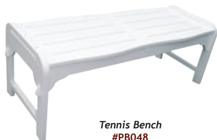
Tennis Bench #PBO48 49"w. x 19"d. x 17"h.