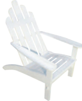
Adirondack Armchair #ADC 22 13 / 16 " w. x 47" d. x 42" h.