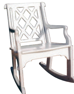
Jefferson Rocker #JR101 - Lattice Back Style (shown) #JR201 - Window Back Style #JR301 - Slat Back Style 22 1 / 2 " w. x 22" d. x 35" h.