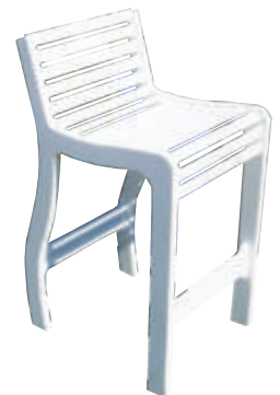
Bar Stool #AFBC30 23" w. x 18" d. x 39" h.