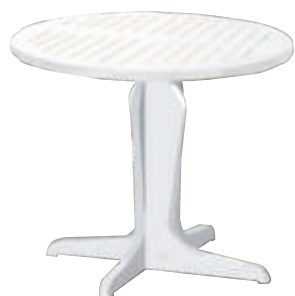
Vase Pedestal Tables #PT30 30" dia. x 29"h. #PT36 36" dia. x 29"h. #PHT4230 30" dia. x 42"h.