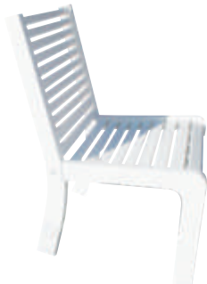
AndureFlex™ Side Chair #AFSSTC 18 1 / 4 " w. x 23 1 / 2 " d. x 33" h. Stacking