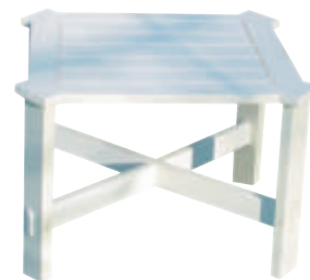
Side Table #JST2024 24"w. x 20"d. x 17"h.