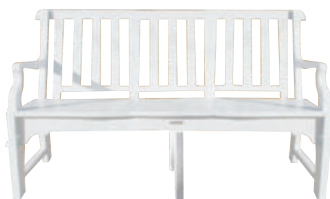
Jefferson Long Bench #JB360 60"w. x 23"d. x 34"h. Slat Back