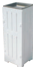
Ash Urn/Plant Stand #AU100 10"w. x 10"d. x 29"h.