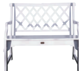
Jefferson Bench #JB148 Lattice Back 49"w. x 23"d. x 37"h.