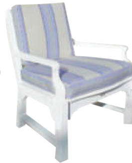
Garden Lounge Chair #JLC301 27" w. x 22" d. x 33" h.