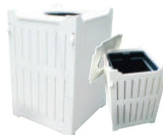
Litter Receptacle w/Lid #LR100 23 1 / 4 "w. x 25"d. x 34"h.