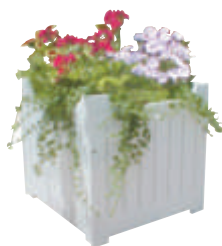
Jefferson Planter #PL100 25"w. x 25"d. x 22"h.