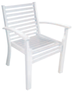
AndureFlex™ Armchair #AFASTC 18 1 / 4 " w. x 23 1 / 2 " d. x 33" h. Stacking

An alloy of resin and titanium for unparalleled strength and longevity.