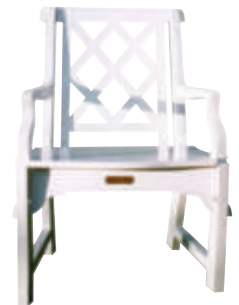
Garden Armchair #JGC1018 22 1 / 2 " w. x 22" d. x 35" h. Lattice Back Style