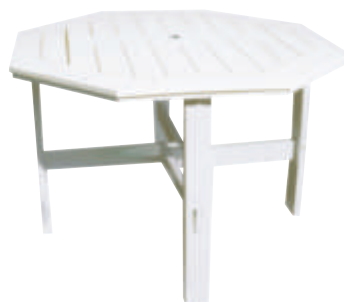
Jefferson Dining Table #JDT042 42"l. x 42"w. x 29"h. Octagon Also available in 48" Round (#RT48)