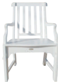
Garden Armchair #JGC301 22 1 / 2 " w. x 22" d. x 35" h. Slat Back Style