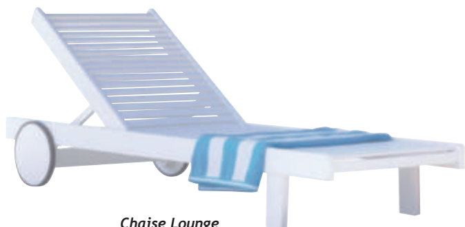
Chaise Lounge #AFC 77"l. x 25"w. x 32"h.

An alloy of resin and titanium for unparalleled strength and longevity.