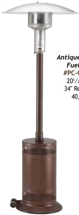
Antique Bronze Propane Fuel Patio Heater #PC-02-AB 90" Height 20½" Base Diameter 34" Reflector Diameter 40,000 BTU/hour

Our infrared propane fuel heaters are designed and crafted to bring warmth, comfort and enjoyment to all of your events. Completely self contained and portable. Uses a standard five-gallon propane cylinder (not included) with approved over-fill protection device. Adjustable heat output. Weather resistant construction. Easy to move wheel kit included.