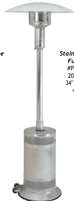
Stainless Steel Propane Fuel Patio Heater #PC-02-S 90" Height 20½" Base Diameter 34" Reflector Diameter 40,000 BTU/hour