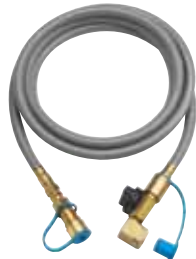
Natural Gas Hook-up/Installation Kit Included

Made of the finest materials—stainless steel, brass, aluminum and powder coated steel—these natural gas heaters are designed to provide many years of safe, convenient and portable heat. Your gas heater comes with a 1 year warranty - limited to the original end use.