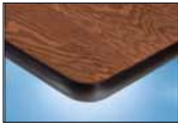
EV SERIES VINYL EDGE

3 / 4 " AC grade, exterior glue plywood top. Aluminum or vinyl T-mold edge. 16 gauge, 1" dia steel legs. Spring-bolt locking leg braces.