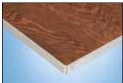
ET SERIES ALUMINUM EDGE