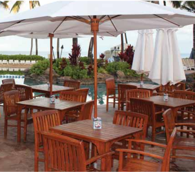
Grand Wailea Resort, Maui Hawaii 9' Fiberteak Market Umbrella