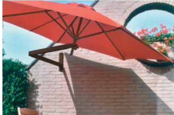
Wall-Mount Umbrella #WALL-MOUNT 9'