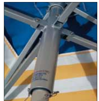
Close-up of Hubs