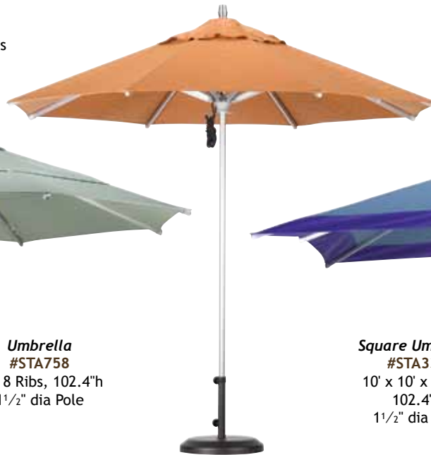
Umbrella #STA758 7' x 8 Ribs, 102.4"h 1 1/2" dia Pole