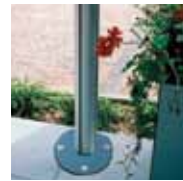
(1) Concrete Mount

Here we have the eight possible pole-mount installation options, including mounting the pole (1) to existing concrete, (2) to an in-ground fitting, (3) to a wood deck, (4) to a half-wall or railing (5) to a free-standing pedestal in a flowerbox with added weight, (6) to a free-standing T-Base with four 100 lb. pavers, (7) using a compression-mount and (8) to a ceiling.