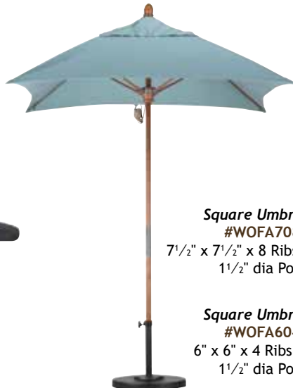
Square Umbrella #WOFA708 7 1/2' x 7 1/2' x 8 Ribs, 102.4"h 1 1/2" dia Pole