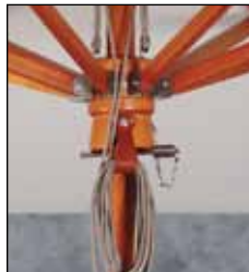
Stainless steel banded Traveler for added durability. Leather pulley line strap for style and function. Featured on Teak & Resort Umbrellas.