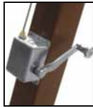
Removable Crank Handle