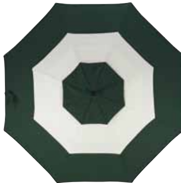
MA Middle Accent Design