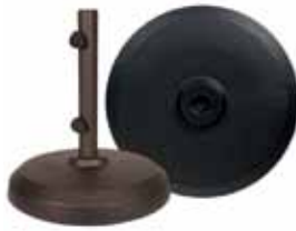
Venice Base #CFCBA150 150 lb Cast Aluminum Stem dia: 1.625" Available in Bronze, Champagne or Black