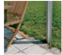
(2) In-Ground Fitting