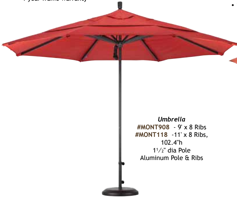
Umbrella #MONT908 - 9' x 8 Ribs #MONT118 - 11' x 8 Ribs, 102.4"h 1 1/2" dia Pole Aluminum Pole & Ribs