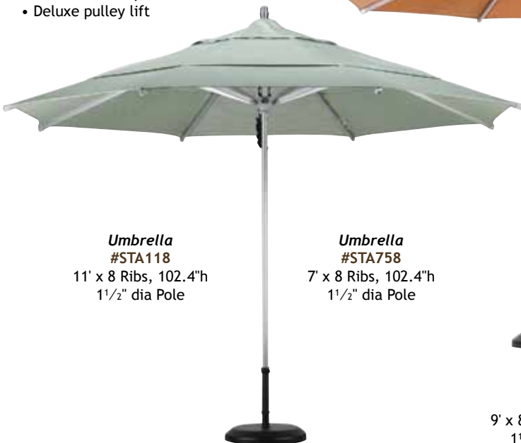
Umbrella #STA118 11' x 8 Ribs, 102.4"h 1 1/2" dia Pole