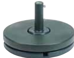
Cement Filled Base #CEMENT FILLED 35 lb or 70 lb Cement Filled Resin Available in White, Green, Black or Sand Stem height: 10" or 17" Stem dia: 1 1/2" or 2" Base: 20" dia For under table & freestanding umbrellas up to 9'