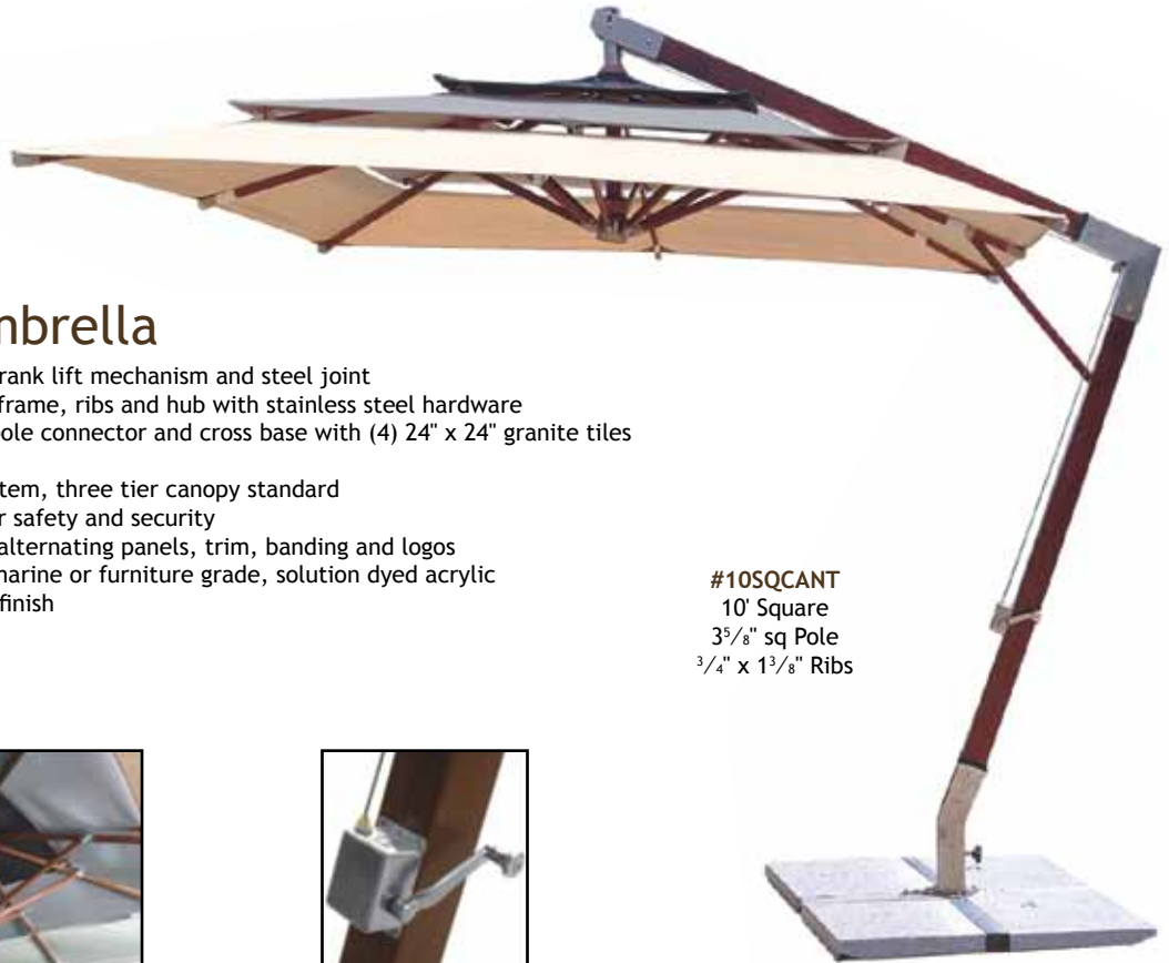
#10SQCANT 10' Square 3 5 / 8 " sq Pole 3/4" x 1 3 / 8 " Ribs