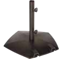
Pentagon Base w/Wheels #BK80 80 lb Cast Aluminum Available in Bronze, Champagne, Firenze or Black Stem dia: 1.625"