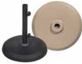
Manhattan Base #CFCBG50 50 lb Cast Aluminum Stem dia: 1.625" Available in Bronze, Champagne, Anthracite, White or Black