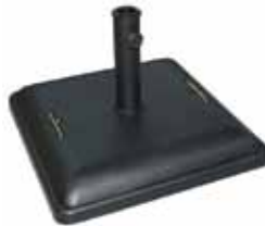
#2239881 81 lb Steel Stem dia: 1 1/2" Available in Black or Platinum