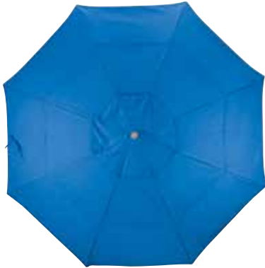
DV Double Wind Vents Standard for 11' Umbrellas