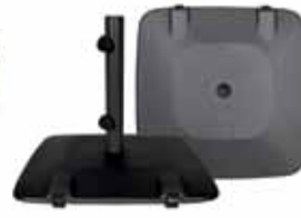
Malibu and Zuma Base w/Wheels #CFCBK100 100 lb Cast Aluminum Available in Bronze, Champagne or Black #CFCBK150 150 lb Cast Aluminum Available in Bronze, Champagne, Anthracite or Black Stem dia: 1.625"