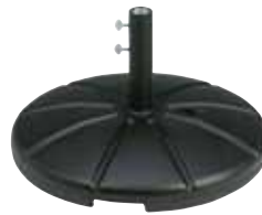
Resin Base w/Fill Cap #986021 35 lb Resin Available in White, Green, Black or Sand Stem height: 13" Stem dia: 1 1/2" Base: 21" dia For use under table