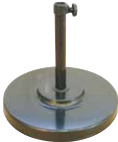
#CFMT 160 50 lb/Steel w/Concrete Bronze, Black, White, Champagne Comes with two stems 16"h and 9"h Stem dia: 1 3 / 4 " For free standing or table set