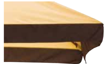
VA 6" Valance Design