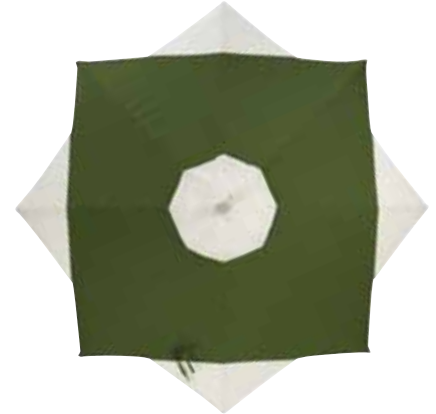
RM RAD Master