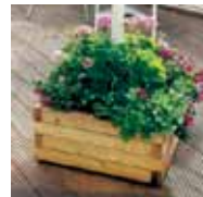
(5) Flowerbox Complete