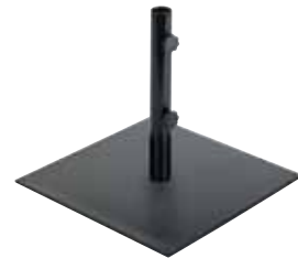
Mall Base #MALL 30, 55 and 90 lb Cast Iron Available in Black or White Stem height: 15"/15"/14" Stem dia: 1 1/2" or 2" Base: 17"/24"/24" sq For freestanding umbrellas up to 13'