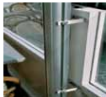
(4) Half-Wall or Railing Bracket