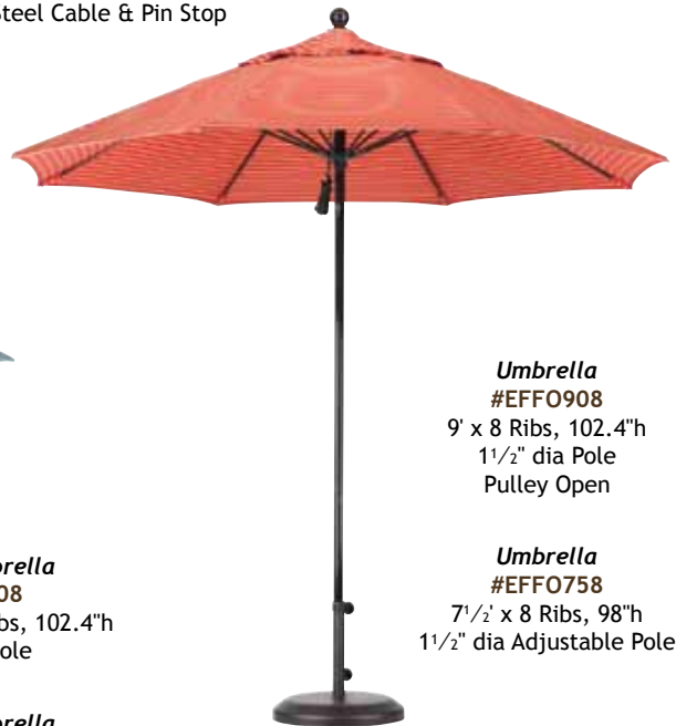
Umbrella #EFFO908 9' x 8 Ribs, 102.4"h 1 1/2" dia Pole Pulley Open