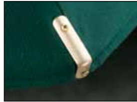
Optional L-Clip can be installed on any wood umbrella in our collections.