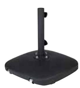
#CMFT 164 80-110 lb/Powder Coated Steel Black, Bronze Stem dia: 2 1 / 4 " Wheels for easy movement