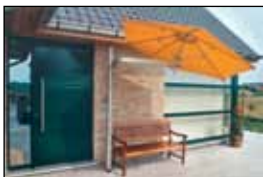
(7) Compression-Mount (for use with Single/Double Poly only)