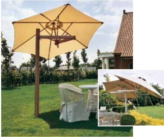
Pole-Mount Umbrella #POLE-MOUNT 9', Single (Inset - 9' Double Pole Mount)

Standard umbrella colors: White, Antique Beige, Camel, Taupe, Brick, Tuscan, Lemon, Walnut, Black, Palm, Macaw. Also see other available colors on page 116. Frame colors: Bronze or Silver.