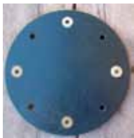
(3) Wood Deck-Mount