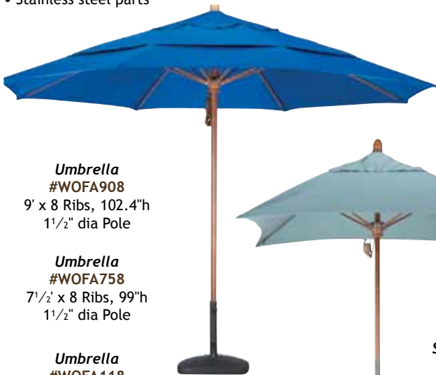
Umbrella #WOFA908 9' x 8 Ribs, 102.4"h 1 1/2" dia Pole