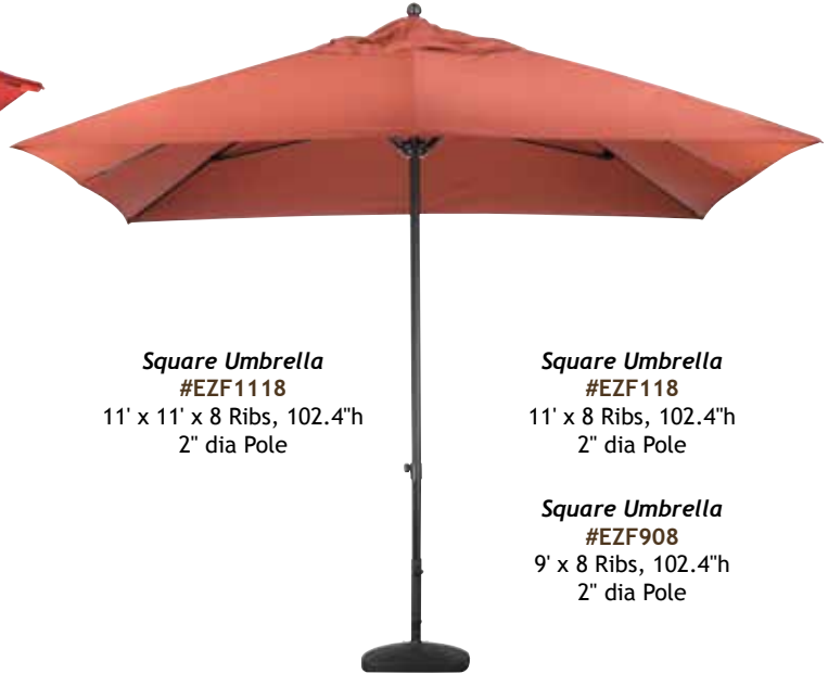
Square Umbrella #EZF1118 11' x 11' x 8 Ribs, 102.4"h 2" dia Pole