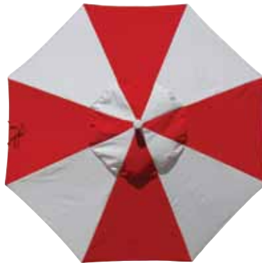
AL Alternating Panels