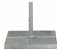
(6) 400# Free-Standing T-Base