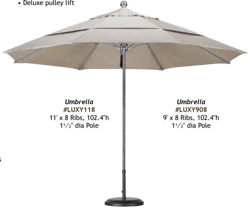
Umbrella #LUXY118 11' x 8 Ribs, 102.4"h 1 1/2" dia Pole