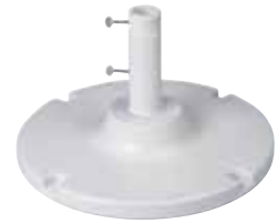
Resin Base & Stem w/Cement Fill #986006 35 lb, Available in Bronze Mist Resin Base Ring w/Cement Fill #986016 35 lb, Available in Bronze Mist