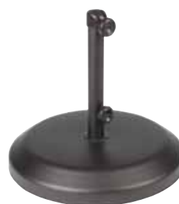
#CMFT 170 70 lb/Steel w/Concrete Black, Bronze Stem dia: 1 3 / 4 " Double knobs for better security Comes with two stems 16"h and 9"h Stem dia: 1 3 / 4 " For free standing or table set