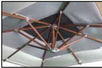
Hub & Rib Detail