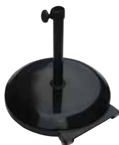
#CFMT 172 75 lb/Steel w/Concrete Black Stem dia: 1 3 / 4 " Wheels for easy movement