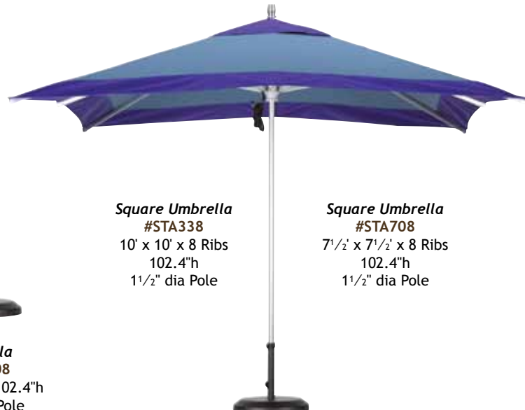
Square Umbrella #STA338 10' x 10' x 8 Ribs 102.4"h 1 1/2" dia Pole