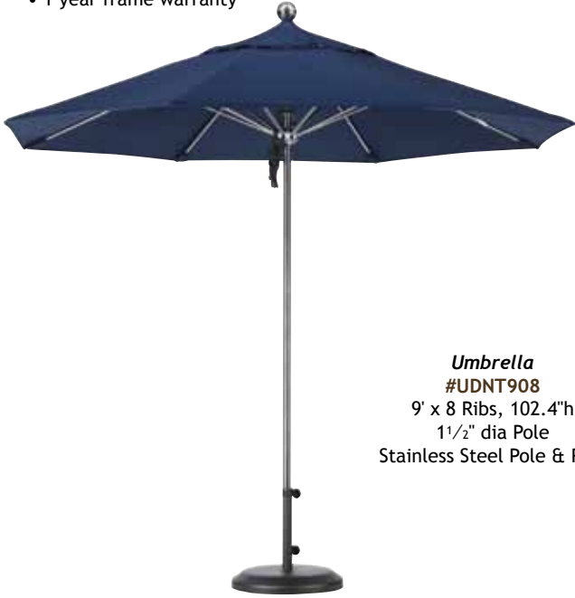
Umbrella #UDNT908 9' x 8 Ribs, 102.4"h 1 1/2" dia Pole Stainless Steel Pole & Ribs