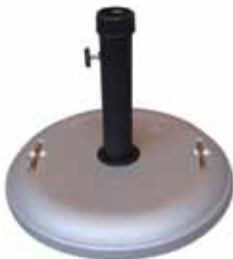
#2239848 48 lb Steel Stem dia: 1 1/2" Available in Black or Platinum