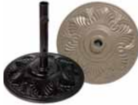
Hermosa Base #CFCBA50 50 lb Cast Aluminum Stem dia: 1.625" Available in Bronze, Champagne, Anthracite, White, Firenze or Black