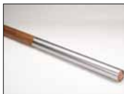
Aluminum sleeve at bottom of pole to inhibit swelling (Teak umbrella only).