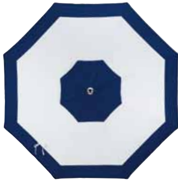
ED 9" Edge Design