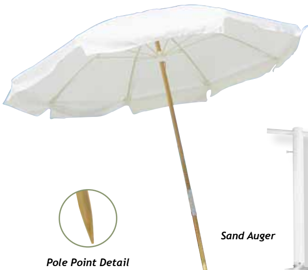
Pole Point Detail